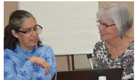
SVdP helps people find jobs.

I write to thank you, whether you are a donor, staff, volunteer or partner. Your contribution provides immediate and tangible assistance and the longer term impact we have on the lives of the neighbors and their children. Our prayer is that we deliver hope and you are part of that.