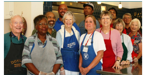
SVdP brings hope to families in need.

Simply put, our outreach would not be as effective without you. You make a difference. You are appreciated!