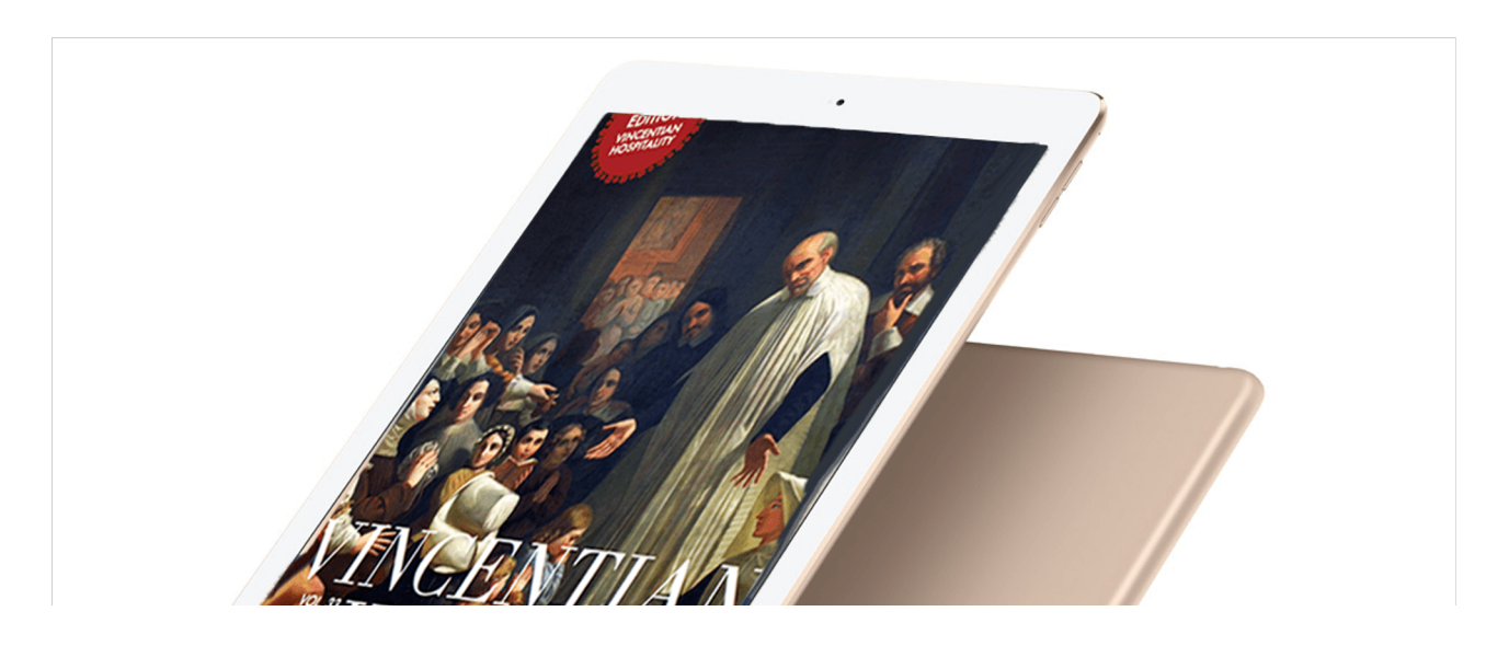
Vincentian Heritage available at https://via.library.depaul.edu/vhj/

Members observe the utmost confidentiality in the provision of material and any other type of support.