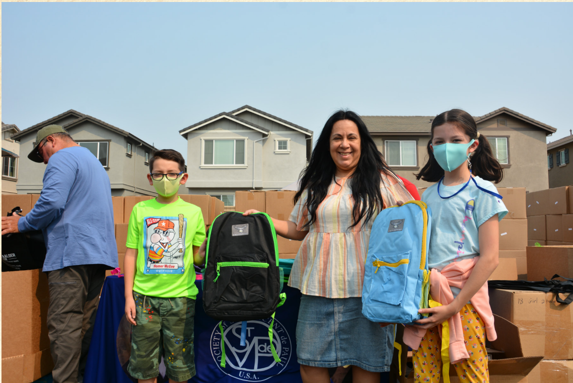
Volunteers help pass out food and school supplies at an SVdP food distribution in Pittsburg, CA.

https://www.dropbox.com/scl/fi/o3bqz44m2mqas5iuvr92v/Volunteer-Opportunities.docx?dl=0&rlkey=vf33gde9jc8jcdskdmk2cmh0t