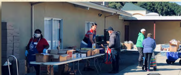
The SVdP Food Pantry at St. Callistus, San Pablo, CA

The Society serves those in need regardless of creed, ethnic or social background, health, gender, or political opinions.