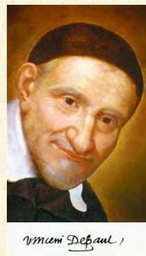
St. Vincent de Paul