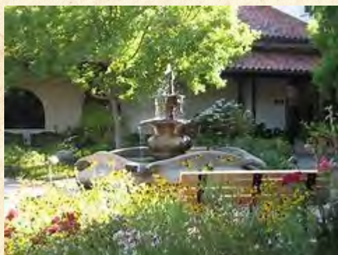
The San Damiano Retreat Center