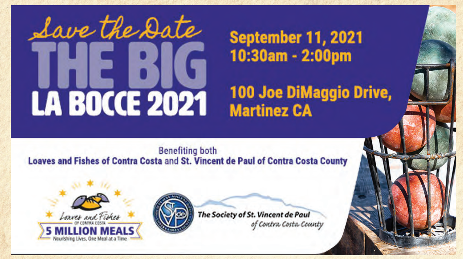
The "Big La Bocce" Bocce Ball Tournament is back!

On September 11, 2021, you can once again play Bocce Ball while supporting St. Vincent de Paul of Contra Costa County and Loaves and Fishes of Contra Costa!