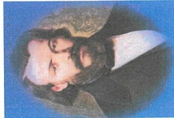
Frederic Ozanam (1813-1853) Founder of the Society of St. Vincent de Paul 1833