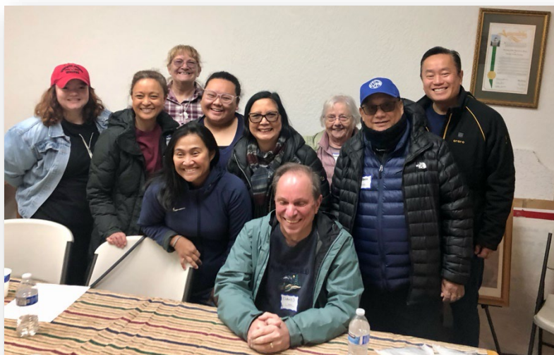
Some of the Vincentians and Volunteers who gave birth to VOTA “What’s VOTA”? – you might be surprised

When is your conference to visit the District Council & Family Resource Center?