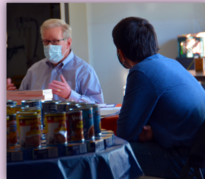
SVdP volunteers build relationships with their neighbors, and work to help them return to a sustainable lifestyle.

Shuttering organizations across the globe, the pandemic has spread suffering like nothing in recent history. Incomes, social interaction, and therapies many in need relied upon disappeared. Here at St. Vincent de Paul of Contra Costa County, volunteer "Vincentians" stepped up and met the suffering, delivering aid in volumes never before imagined. SVdP's Vincentians fed over 120,000 people during large-scale food distributions, distributed over $1 million in rental assistance to help keep their neighbors housed, and they did it because they care for their community.