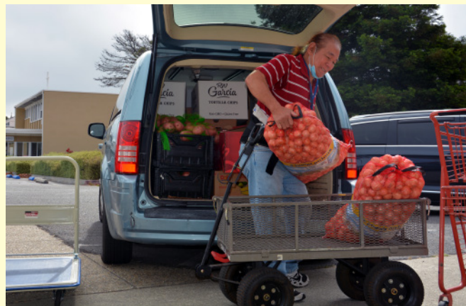
SVdP volunteers work hard to source and distribute healthy food.