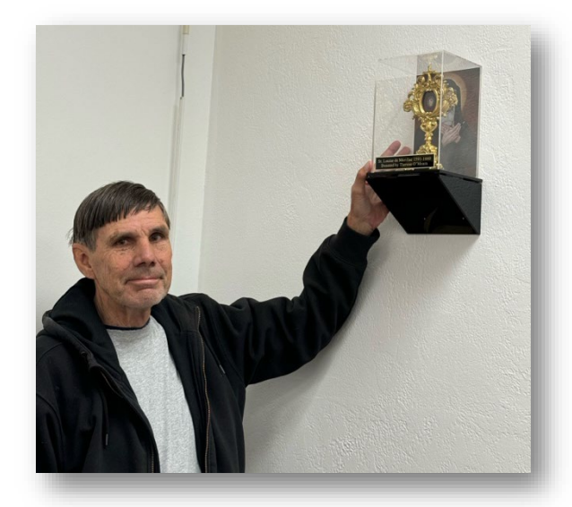
Relic of St. Louise de Marillac: A Sacred Connection to Vincentian Heritage

The relic of St. Louise de Marillac is prominently mounted in the lobby of the Family Resource