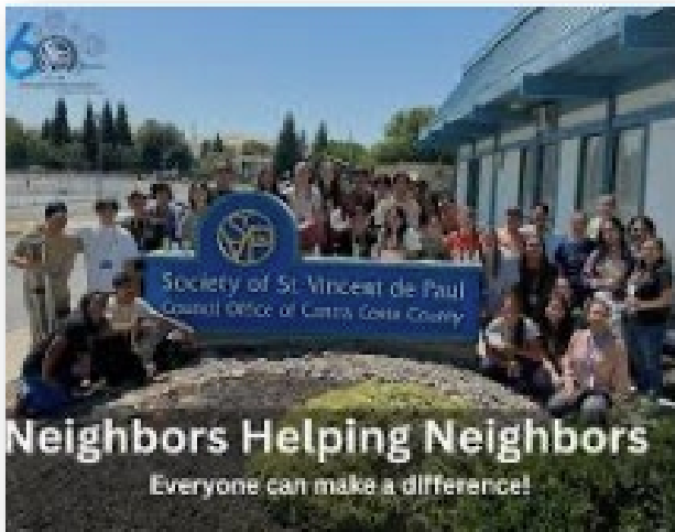
A Living Conference is a Shared Conference

When responsibilities are shared, we live out the Vincentian spirit more fully. Delegating roles is not about assigning chores—it's about inviting others to experience the joy of service , the peace of prayerful leadership, and the strength of community. Use this list as a starting point to reflect, discern, and reenergize your Conference. Meet with members individually to learn their gifts and interests. A simple conversation might be all it takes to invite someone into deeper service.